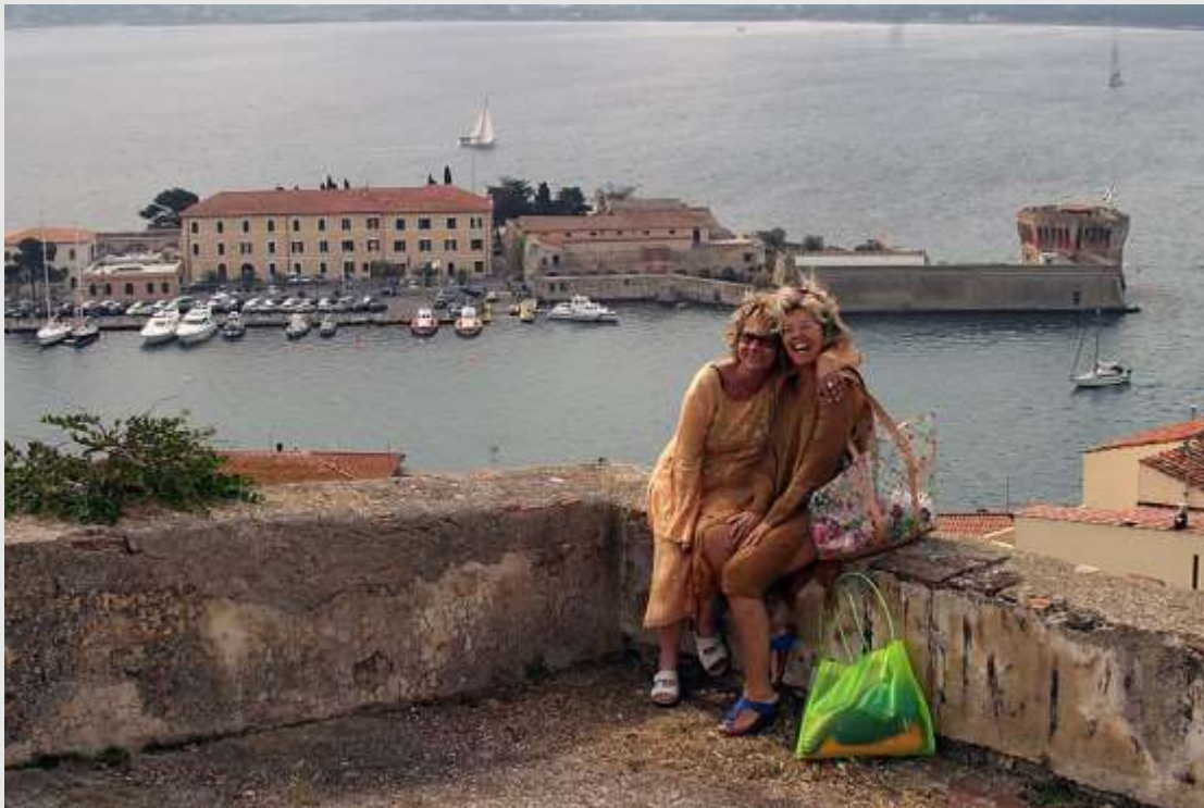
A view on the dockyard from the sixteenth century fortress